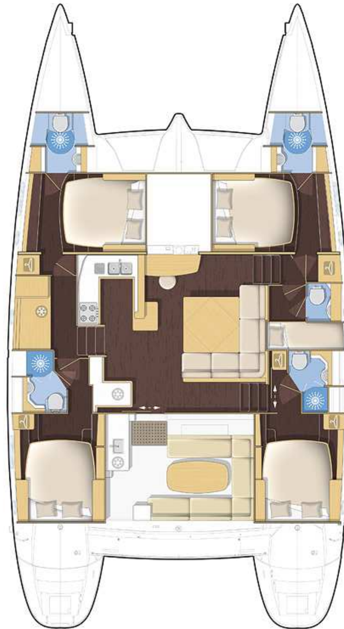
Version 5 cabins / 5 cabin version

Dinghy with hard bottom & outboard motor, Floating mats, tubes, Kayak, snorkel gear, windsurf*, underwater lights for night swimming